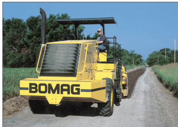
MPH362R-2 hard at work

With the BOMAG MPH 362 & 364-2 Recycler, old and deteriorated asphalt pavements can be cut, pulverized and mixed with new binding agents. This RAP ( Recycled Asphalt Product) material is reused to provide a new road base material. This ecological and economical alternative of recycling pre-existing surfaces offers a cost effective solution to road maintenance.