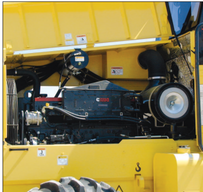
Wide opening hoods and access doors provide easy access to maintenance items and for cleaning purposes.