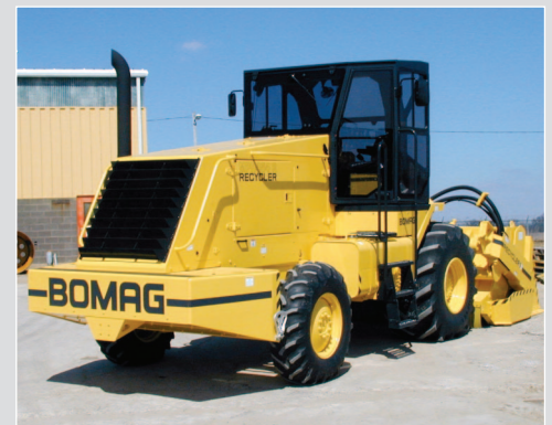
MPH362-2 shown with optional all-weather cab and air conditioning.

With these features and many more, it's easy to see why these models maintain a high residual value while delivering lower lifetime operating costs.