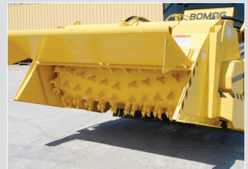
Easy and convenient replacement of cutting teeth without special tools.