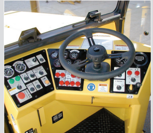
Convenient positioning of operational controls and indicators for increased comfort and productivity.